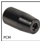
PCM Fixed cylindrical handle, Fixed non-turning handle