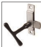
Latch and key