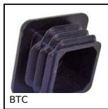
BTC End cap for square tube, Standard