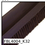
FBL4004_K32 Brush strip per metre, Black striated polypropylene (PP)