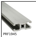
PRF1945 Standard aluminium profile, 19 x 45 mm