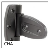
CHA Heavy duty plastic hinge, opens 180°, Heavy duty - Opens 180°