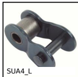
Chain link, Steel