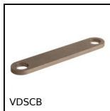
VDSCB Sliding lock adjustment system, Blocking wedge for sliding lock for ...