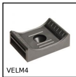
VELM4 Screw-on base for hook-and-loop strip, Polyamide