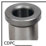
Flanged drill bushing, Steel