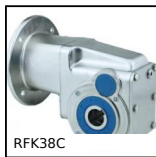
RFK38C Hypoid gearbox - Stainless steel, up to 200 Nm