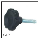
GLP Small 6 lobe threaded handle - male, Technopolymer - Steel