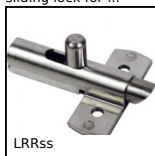
LRRss Latch, Spring loaded latch - stainless steel