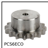
PCS6ECO Chain sprocket - steel, 6mm (DIN 04-1)