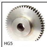
Steel spur gear, Steel 20NCD2