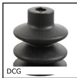
DCG Suction cup, 2.5 bellows, nitrile