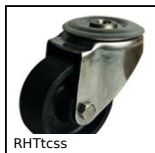
High Temperature Castor, up to 200kg