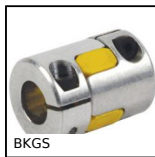
BKGS Backlash free coupling Gerwah®, from 1.2 to 450Nm