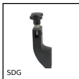
SDG Adjustable guide support bracket, Plastic