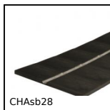
Roll of hinge without pin, Plastic hinge