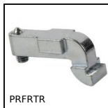
PRFRTR Cross connector for aluminium profile, Cross connector