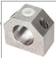
SA: housing only