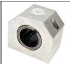
SAKH: housing + KH bearing