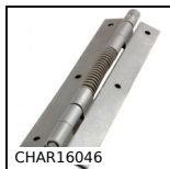
CHAR16Q46 Spring hinge, screwed