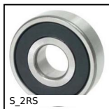
S_2RS Deep groove ball bearing, Stainless steel