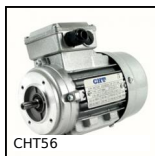
CHT56 Asynchronous AC motor, 0.09kW