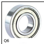
Q6 Deep groove ball bearing, Steel