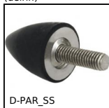
D-PAR_SS Stainless steel elastomeric mount, stainless steel