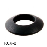
RCX-6 Spherical tilt washer - DIN6319, convex