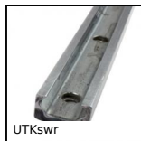
UTKswr Utilitak® V rail, V rail