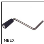
MBEx Hexagonal ended handle, Hexagonal ended handle