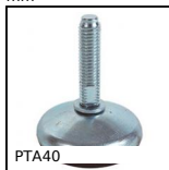
Articulated foot with solid base foot Ø 40, 30000N