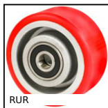
Wheel, Polyurethane - Aluminium rim (Free running)