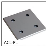
Joining plate for aluminium profile, Joint plate - 86x86 mm