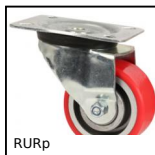
Wheel pivoting with plate, Polyurethane - Aluminium rim (Free running)