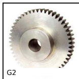
Steel spur gear, Steel 20NCD2