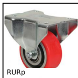
Fixed castor with plate, Polyurethane - Aluminium rim (Free running)