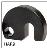
Captive C washer, DIN 6371