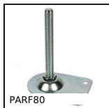
Pressed steel base rigid foot, Swivelling - Ø80