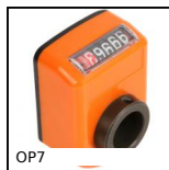
OP7 Mechanical digital position indicator, 5 numbers