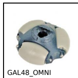
GAL48_OMNI Omni-directional roller, Omni-directional