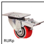
Swivel castor with double brake, Polyurethane - Aluminium rim (Free running)