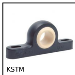
Igubal® pillow block bearing, Polymer