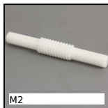
Worm and wheel set, Machined plastic (delrin)