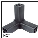
Square tube connector, Fixed angle