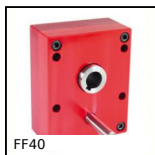
Offset spur gear reducer, from 59 to 210 Nm