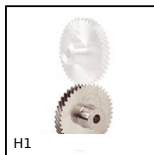
H1 Crossed helical gear crossed axis at 90°, Steel 20NCD2