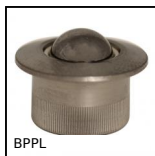
Mini plain bearing ball transfer unit, For countersinking