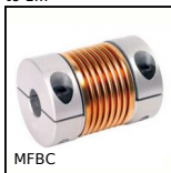
MFBC Flexible Bellows coupling, Aluminium and Bronze - with clamping jaw