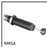
Adjustable shock absorber, Adjustable