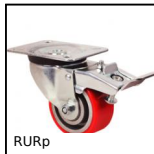
RURp Swivel castor with double brake, Polyurethane - Aluminium rim (Free running)