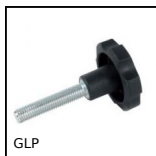
Small 6 lobe threaded handle - male, Technopolymer -