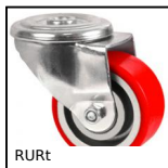
RURt Swivel castor with central hole, Polyurethane - Aluminium rim (Free