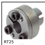
Self-centering flanged locking assembly, Medium/high torque