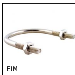
Stainless steel U bolt, Stainless steel