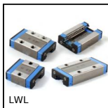
LWL Linear ball slide - Stainless steel balls, Chariot - from 514 N to 1...