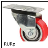
RURp Wheel pivoting with plate, Polyurethane - Aluminium rim (Free running)