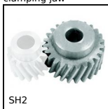
SH2 Parallel axis helical gear, Steel 20NCD2