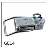
GE14 Toggle latches, With padlock-holder