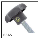
BEAS Star shaped anti-static handle, Star,