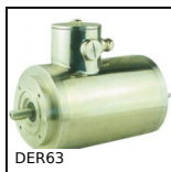
DER63 Stainless steel AC asynchronous motor