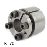
RT70 Self-centering locking Assembly, Medium/high torque