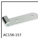
AC156-157 Strike for toggle latch, 25.5mm