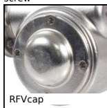
RFVcap Stainless steel protective cover, Closed protective