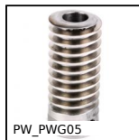
PW_PWG05 Worm - precision range, Steel