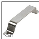
PGMT Pull handle, Stainless steel