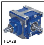
HLA28 Right angle spiro bevel gearbox, Up to 182Nm