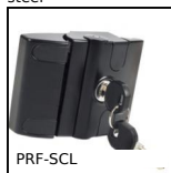
PRF-SCL Lock for aluminium profile, Lock for sliding doors