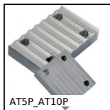
AT5P_AT10P Connecting plate for AT type timing belts, AT5