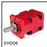
Internal epicyclic servo reducers, from 8 to 19 Nm