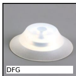
Flat suction cup, silicon