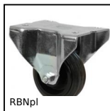
Fixed castor with plate, Steel - rubber