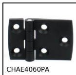
Decorative asymmetric screwed hinge, Polyamide