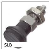
Indexing plunger, stainless steel