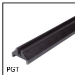
Sliding profile, Sliding panel support