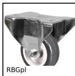
Fixed castor with plate, Steel - grey rubber