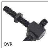
Adjustable screw stop, Steel