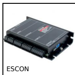
ESCON Speed controller 5A, 5 A