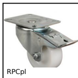
RPCpl Swivel castor with double brake, Steel - Polyamide