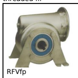
RFVfp Stainless steel worm and wheel gearboxes,