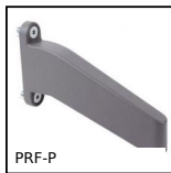
PRF-P Aluminium profile feet support, For feet or casters