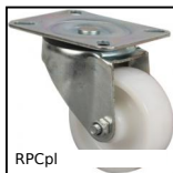
RPCpl Swivel castor with plate, Steel - Polyamide