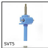
SVT5 Screwjack with travelling screw, with translating screw