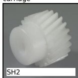
SH2 Parallel axis helical gear, Machined plastic (delrin)