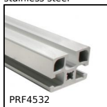
PRF4532 Standard aluminium profile, 45 x 32 mm