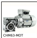
CHM63-MOT Asynchronous AC motorgearboxes 0.37 to 1.5kW, 0.37 to 1.5kW