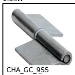
CHA_GC_9SS Stainless steel garnet hinge, To be welded