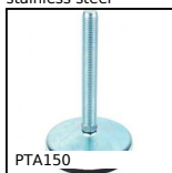
PTA150 Articulated levelling foot, pressed base Ø150, Ø 150