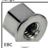
EBC Cap nut Hygienic Design®, Compact