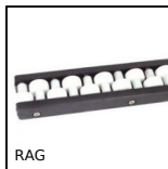
RAG Roller guide,