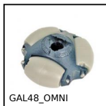
GAL48_OMNI Omni-directional roller, Omni- directional