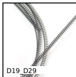
D19 D29 Compression springs in metre length steel, by the metre