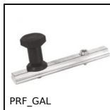
PRF_GAL Roller for aluminium profile, Fixing kit for roller concentric