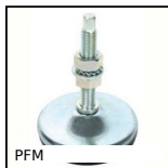
PFM Fixed levelling foot, Flanged plate