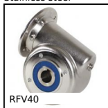
RFV40 Stainless steel worm and wheel gearbox, up to 47 Nm