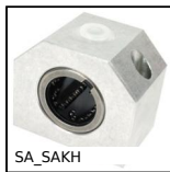
SA_SAKH Housing for linear bearing, Closed - light load