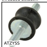
ATZYSS Stainless steel diabolo shaped elasto mount, Stainless steel