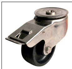
Double locking swivel