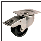
Double locking swivel