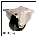
RHTplss High Temperature Castor, up to 200kg