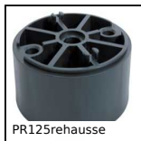
PR125rehausse Extension for articulated foot Ø123, articulated foot PR125