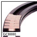
GCB880 Curved guide, Ranges 880 and 881