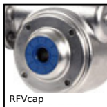
RFVcap Stainless steel gearbox - accessories, Open protective cover