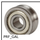
PRF_GAL Roller for aluminium profile, Hollow roller ø12