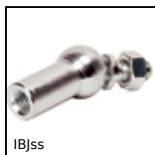
IBJss Ball and socket joint, Stainless steel