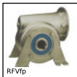
RFVfp Stainless steel gearbox - accessories, Mounting bracket