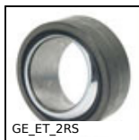
GE_ET_2RS Spherical bearing, Hard chromium / Teflon contact with seals