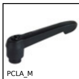
PCLA_M Clamping lever - female, Plastic