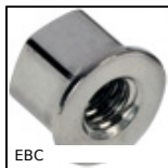
EBC Cap nut Hygienic Design®, Compact