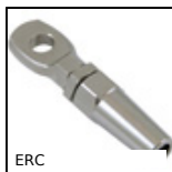
ERC Quick fitting cable terminals, Eye version