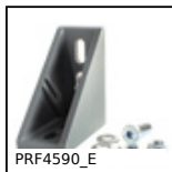
PRF4590_E Angle bracket, PRF4590