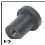
ECF Well nut, Elastomer