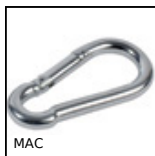
MAC Carabiner, Steel