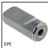
EPE Wing nuts Hygienic Design®, Narrow