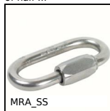
MRA_SS Stainless steel Quick link, Stainless steel