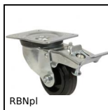
RBNpl Swivel castor with double brake, Steel - rubber