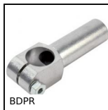
BDPR Holding arm, Rigid