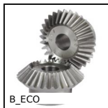
B_ECO Eco. range steel bevel gear, 1:1