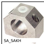
SA_SAKH Housing for linear bearing, Closed - light load