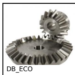
DB_ECO Eco. range steel bevel gear, 2:1