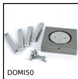
DOMI50 Accessories, Turntable