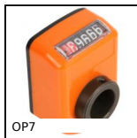
OP7 Mechanical digital position indicator, 5 numbers