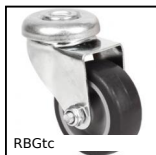
RBGtc Swivel castor with central hole, Steel - grey rubber