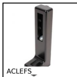
ACLEFS Floor anchor for aluminium profile, Adjustable