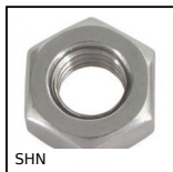
SHN Hexagonal nut DIN934, Steel (Class 6[8])