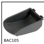
BAC105 Storage bin, 8mm