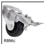
RBNtc Swivel castor with central hole, Steel - rubber - with double brake