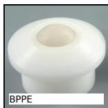
BPPE Ball transfer unit push fit, Light