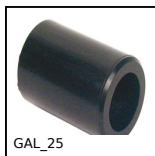
GAL_25 Ø25 conveyor roller, Without ball bearing