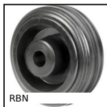
RBN Wheel, Rubber tyre - Polypropylene rim