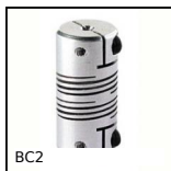
BC2 Panamech, Multi-Beam, Aluminium - with clamping jaw