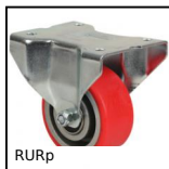
RURp Fixed castor with plate, Polyurethane - Aluminium rim (Free running)