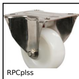
RPCplss Fixed castor with plate, Stainless steel - Polyamide