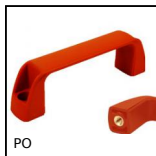
PO Pull handle - Multi-selector, Tapped recessed insert