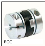
BGC Oldham coupling, Clamp