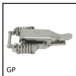
GP Spring loaded toggle latch, Standard (GP22-GP23)