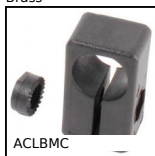
ACLBMC Detector support for aluminium profile, Sensor holder