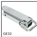
GE32 Sprung toggle latch with connecting link, Standard