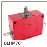
BLHM70 Right angled gearbox, up to 128 Nm