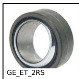
GE_ET_2RS Spherical bushing, Hard chromium / Teflon contact with