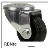
RBNtc Swivel castor with central hole, Steel - rubber