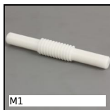
M1 Worm and wheel set, Machined plastic (delrin)