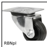
RBNpl Swivel castor with plate, Steel - rubber