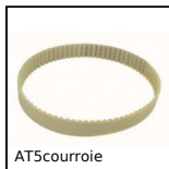
AT5coured AT type timing belt, AT5 Steel cored polyurethane