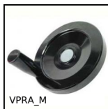
VPRA_M Handwheel with handle, Thermosetting plastic