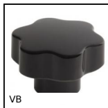
VB Small 6 lobe threaded handle - female, Duroplast - Brass