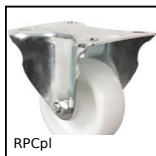
Fixed castor with plate, Steel - Polyamide