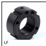
Precision locknut, Precision locknut