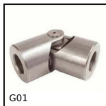
Single universal joint, Normal duty