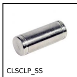
Clevis components, short version,