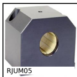
Drylin R® linear bearing housing,