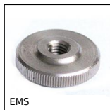
Stainless steel knurled thumb nut, Knurled