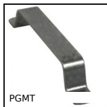
Pull handle, Steel