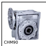
Worm and wheel gear reducer, up to 540