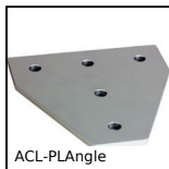
ACL-PLAngle Joining plate for aluminium profile, Angle connection