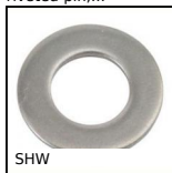
SHW Plain washer, Steel