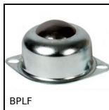
BPLF Ball transfer unit light duty, Light