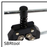
SBRtool Chain tool, Drive chain maintenance tools