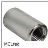
MCLred Reducing sleeve female/female, Cylindrical - stainless steel