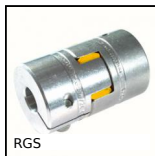
RGS Rotex® GS backlash free jaw coupling, from 0.5 to 190Nm