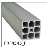
PRF4545_P Stripp Aluminium profile with