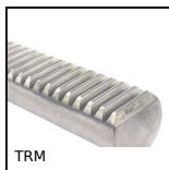
TRM Spur round rack, Steel - module 1-6