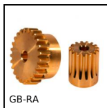
GB-RA Brass spur gear, Brass CuZn39Pb3