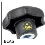
BEAS Knob star grip antistatic, Star, anti-