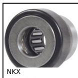
NKX Combined bearing without inner ring, Needle and ball bearings