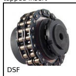
DSF Slip friction clutch, 4 to 2600 Nm