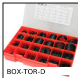
BOX-TOR-D Box set of Nitrile O-rings in nitrile, 18.00 x 2.00mm to 50.00 x 5.00