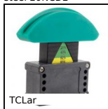
TCLar Automatic chain tensioner, With wide guide