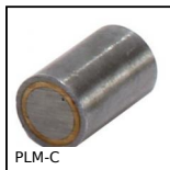
PLM-C Cylindrical holding magnets, Cylindrical holding magnet