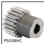
PSG08HC Skive hobbed spur gears - precision range, Case hardened steel 20NCD2