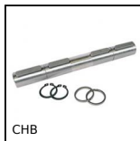
CHB Double output shaft, For CHB gearbox