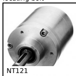
NT121 Spur gear coaxial gearbox, from 20 to 68 Nm - Inline