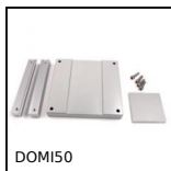
DOMI50 Accessories, Plate