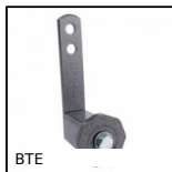
BTE Universal tension arm, For normal applications