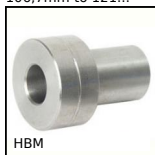
HBM Adjustment bushing for half-rail guide,