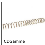
CDGamme Compression spring DIN2095, DIN 2095