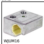
WJUM16 Drylix® W bearing block, Slide