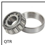
QTR Tapered roller bearing, Steel