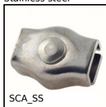
SCA_SS Stainless steel flat cable clamp, Stainless steel