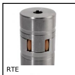
RTE Rotex®, jaw coupling, cast iron