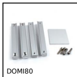
DOMI80 Connecting kits, XY linking kit