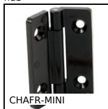
CHAFR-MINI Miniature friction hinge, Friction