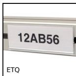
ETQ Magnetic label holder for aluminium profile,