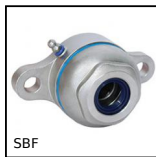
SBF Sealed flange bearing unit for Food Industry, cover