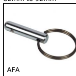
AFA Locking pin, with ring