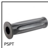
PSPT Flexible tube handle, PVC