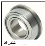
SF_ZZ Deep groove ball bearing, Stainless steel