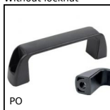
PO Pull handle - Multi- sector, Smooth hole