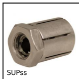
SUPss Self-centering clamping hub stainless steel, Without locknut