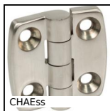
CHAEss Decorative hinge, Stainless steel