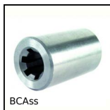
BCAss Stainless steel splined bush, Inox