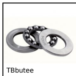
TBbutee Axial thrust bearing, Steel balls