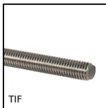
TIF Threaded rod - DIN975, Stainless steel A2