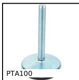
PTA100 Articulated levelling foot, pressed base Ø100, Ø 100