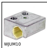
WJUM10 Drylin® W bearing block, Slide