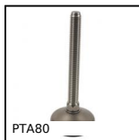
PTA80 Articulated levelling foot, pressed base Ø80, Ø 80