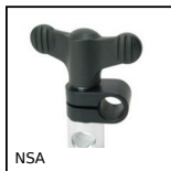
NSA Adjustable clamp, Articulated