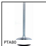
PTA80 Articulated levelling foot, pressed base Ø80, Ø 80