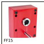
FF15 Offset spur gear reducer, from 2.20 to 10 Nm