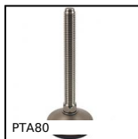
PTA80 Articulated levelling foot, pressed base Ø80, Ø 80