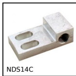
NDS14C Angular connector, Universal angular connector