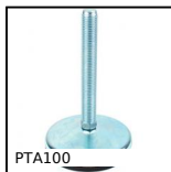
PTA100 Articulated levelling foot, pressed base Ø100, Ø 100