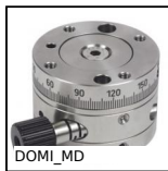
DOMI_MD Domino rotary table, 55/1