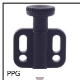
PPG Indexing plunger with flange, With horizontal mounting flange