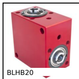
BLHB20 Right angled gearbox, bored shafts, up to 1.77 Nm