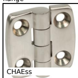
CHAEss Decorative hinge, Stainless steel