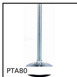
PTA80 Articulated levelling foot, pressed base Ø80, Ø 80