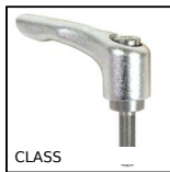
CLASS Stainless steel indexing handle - male, Stainless steel