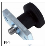
PPF Indexing plunger with flange, with drilled