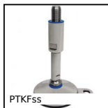
PTKFss Fixable foot for the food industry, Stainless steel - 3-A standard