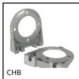
CHB Feet, For CHB gearbox