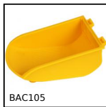
BAC105 Storage bin, 8mm