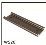
WS20 Drylin® W rail, Rail