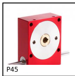
P45 Worm and wheel gear reducer, up to 40 Nm