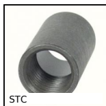
STC Shock Absorber - stop collar, Universal flange