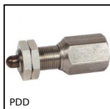
PDD Spring plunger, With sensor adaptor