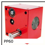
PP60 Worm and wheel gear reducer, from 17.80 to 34 Nm