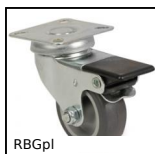
RBGpl Swivel castor with double brake, Steel - grey rubber