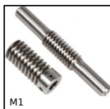
Worm and wheel set, Non hardened steel