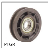
Tensioner pulley, For round belts