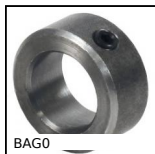
BAG0 Locking rings in steel, Steel