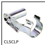
Clevis components, short version, Steel - Short range