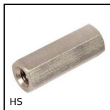
HS Hexagonal spacer, Stainless steel 303