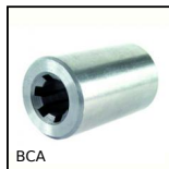
BCA Steel splined collar, Steel