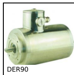
DER90 Stainless steel AC asynchronous motor 1.1 - 1.5kW, 1.1 to 1.5kW