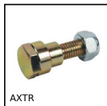
Axle for tensioner pulley, Shaft