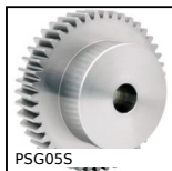
Spur gear - precision range, Stainless steel 316