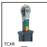
Automatic chain tensioner, With steel