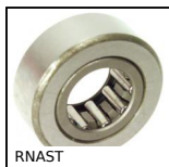
Cam follower without axial guide, Without interior ring