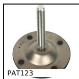
PAT123 Pressed stainless steel articulating foot Ø123, Ø 123