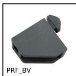
PRF_BV Screw block, Panel addition and fastening