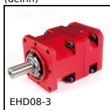
EHD08-3 Internal epicyclic servo reducers, from 20 to 50 Nm