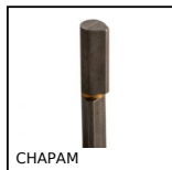
Weld-on hinge with flat end, Steel