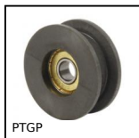
Tensioner pulley, For flat belts