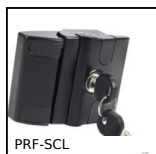
Lock for aluminium profile, Lock for