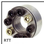
RTT Locking Assembly, Medium/high torque