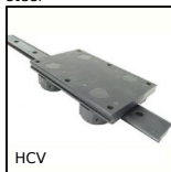
HCV V-rail guidance Simple Select® system, on rail