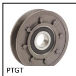
PTGT Tensioner pulley, For V belts