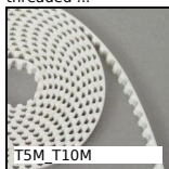
T5M_T10M T type timing belt per metre, T5 Steel cored polyurethane