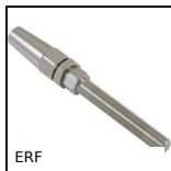
ERF Quick fitting threaded cable terminal, Cable terminal with threaded ...