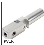
PV1R Adjustable suction-cup support, Standard grip