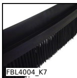
FBL4004_K7 Brush strip per meter PA6 fibres Ø0.3 to Ø0.5, Black polyamide 6 ...