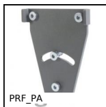
PRF_PA Angle plate for aluminium profile,