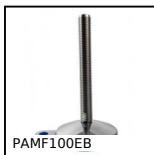
PAMF100EB Articulated foot with sheet metal base Ø100, Articulated foot