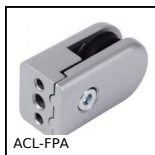
ACL-FPA Panel mounting block for aluminium structures, Support block