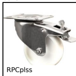
RPCplss Swivel castor with double brake, Stainless steel - Polyamide