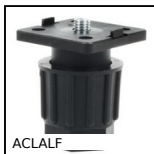
ACLALF Adjustable foot for aluminium profile, Ideal for workstations