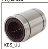
KBS_UU Stainless steel closed precision linear