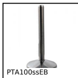
PTA100ssEB Articulated foot with sheet metal base Ø100, Articulated foot