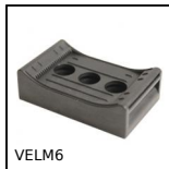
VELM6 Screw-on base for hook-and-loop strip, Polyamide