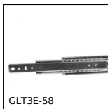
GLT3E-58 Telescopic drawer,