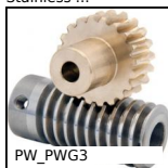
PW_PWG3 Wheel - precision range, Bronze