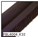
FBL4004_K32 Brush strip per metre, Black striated polypropylene (PP)