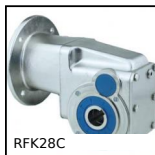
RFK28C Hypoid gearbox - Stainless steel, up to 130 Nm