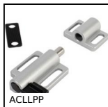
ACLPP Latch for aluminium profile, Spring operated latch