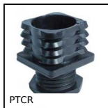
PTCR Adjustable furniture foot, square tube