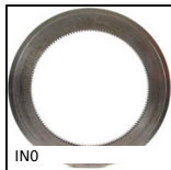
INO Internal gear, Steel 20NC2