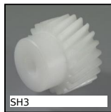
SH3 Parallel axis helical gear, Machined plastic (delrin)