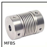
MFBS Stainless steel flexible bellows coupling, Stainless steel - with se...