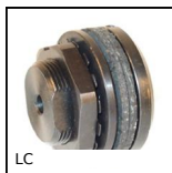
LC Friction clutch, 190 to 1800 Nm