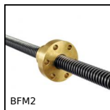
BFM2 Flanged bronze nut, Bronze - 2 threads