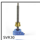
SVR30 Screwjack with travelling nut, with moving nut