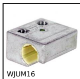
WJUM16 Drylin® W bearing block, Slide