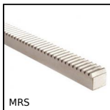
MRS Stainless steel metric section rack, Stainless steel