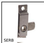
SERB Cam latch, Cam latch