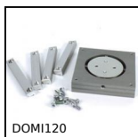
DOMI120 Accessories, Turntable