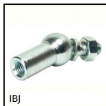
IBJ 180° ball and socket joints, Steel