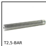
T2,5-BAR T type tooth bar stock, T2.5