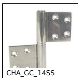
CHA_GC_14SS Stainless steel garnet hinge, To screw