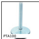
PTA100 Articulated foot with pressed base, Ø 100