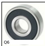
Q6 Ball bearing, Steel