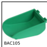
BAC105 Storage bin, 8mm