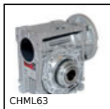
CHML63 Worm and wheel gearbox, up to 138 Nm - Integrated torque limiter