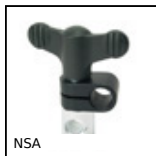
NSA Adjustable cross clamp, Articulated