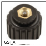
GSI_A Gas spring, Gas control screw