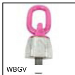
WBGV Lifting ring, Threaded