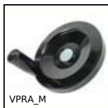
VPRA_M Hand wheel, Thermosetting plastic - galvanised steel hub