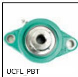
UCFL_PBT Flange bearing, Polymer and stainless steel