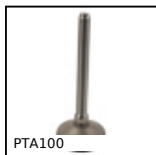
PTA100 Articulated foot with pressed base, Ø 150