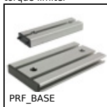
PRF_BASE Floor anchor, Base plate