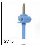
SVT5 Screwjack, with translating screw