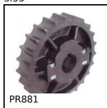
PR881 Idler sprocket for slat top chain, Range 881