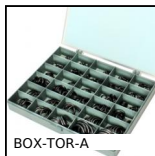
BOX-TOR-A Box set of Nitrile O- rings in nitrile, 2.90 x 1.78mm to 28.17 x 3.53