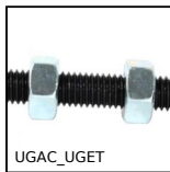
Connection for threaded actuator rod, Connection for threaded actuat...