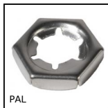
Self locking counter nut, For axial locking