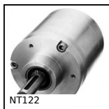
Spur gear coaxial gearbox, from 32 to