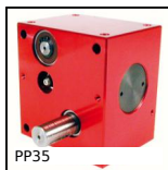
Worm and wheel gear reducer, from 2.20 to