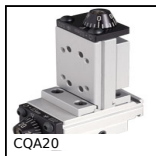
Accessory for adjustment slide-system, 20