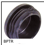
End cap for round tube, Standard