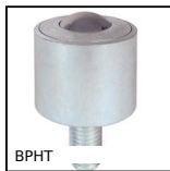
Ball transfer unit bolt fitting, Heavy