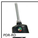
Mounting feet with integrated castors,