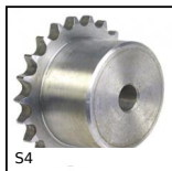
Chain sprocket- stainless steel, 4mm