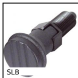
Indexing plunger, steel class 5.8