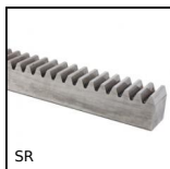
Narrow spur rack, Stainless steel