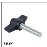
Male wing knob, Technopolymer with