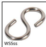
Symmetrical S shaped hook stainless steel, Stainless steel