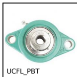
Stainless steel/Polymer flanged bearing, Polymer and stainless steel