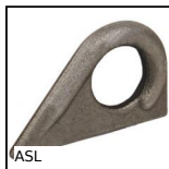
45° Hoist ring for welding, for 45° lifts - for welding