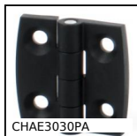
Square decorative screwed hinges, Polyamide