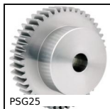
Spur gear - precision range, Case hardened steel 20NCD2