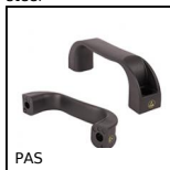
Pull handle, Reinforced PA thermoplastic