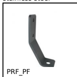
Anchoring bracket for aluminium profile, Anchor