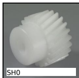
Parallel axis helical gear, Machined plastic (delrin)