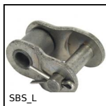
Chain link, Stainless steel