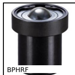
Ball transfer unit housed spring loaded, High