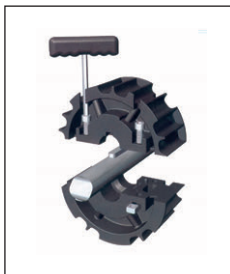
Two part design