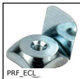
Nut for aluminium profile, Steel square nut with tab