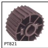
PT821 Drive sprocket for slat top chain, Ranges 821 and 805