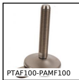
PTAF100-PAMF100 Articulated fixable foot with pressed base Ø100, Ø 100