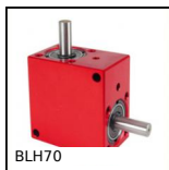
BLH70 Right angled gearbox, from 26 to 128 Nm