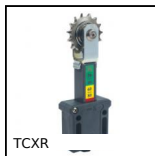
TCXR Automatic chain tensioner, With steel sprocket