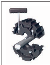
Two part design