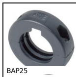
BAP25 Plastic clamping collar, Ø25 - Ø40