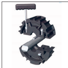
Two part design