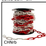
CHNrb Warning chain with red and white links, Steel