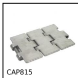
CAP815 Slim slat top chain stainless steel, Narrow range 815