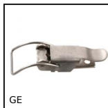
GE Toggle latches, Standard