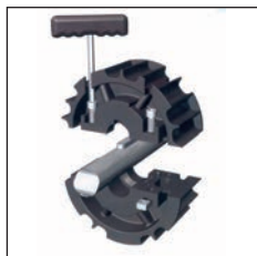
Two part design